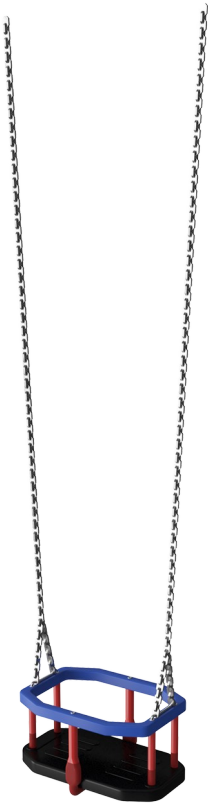
SWING MODULE 3PP CRADLE SEAT H:2.5m SS CHAINS